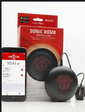
Mobile Phone Signaler