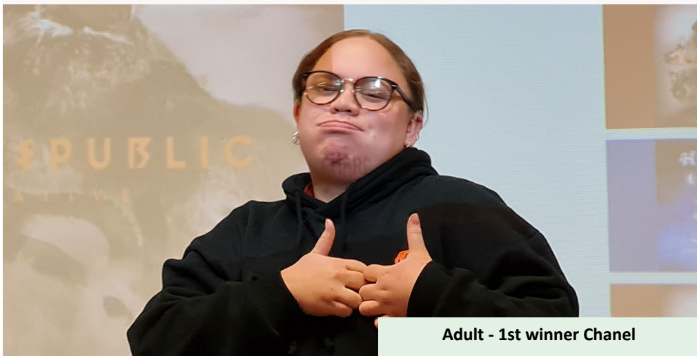
Adult - 1st winner Chanel