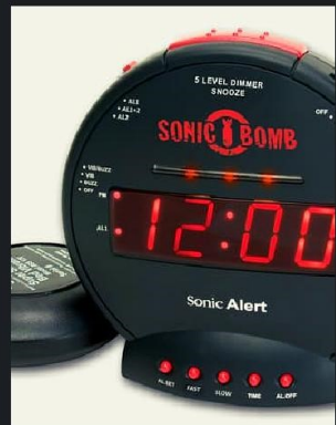
Vibrating Alarm Clocks