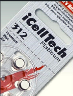
Batteries from $39.95