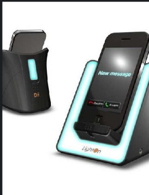
Mobile Phone Signaler