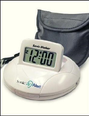
Travel Alarm Clocks