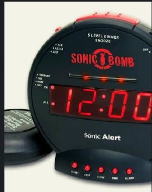
Vibrating Alarm Clocks