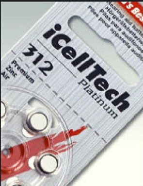
Batteries from $39.95