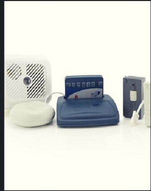
Alarms for Work